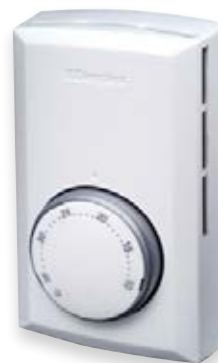
TS / TD