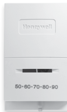
T822K 1034* / T822K 1018**

*Celsius scale for Canada **Fahrenheit scale for United States