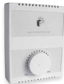
CCTHV No Display

*Celsius scale for Canada **Fahrenheit scale for United States